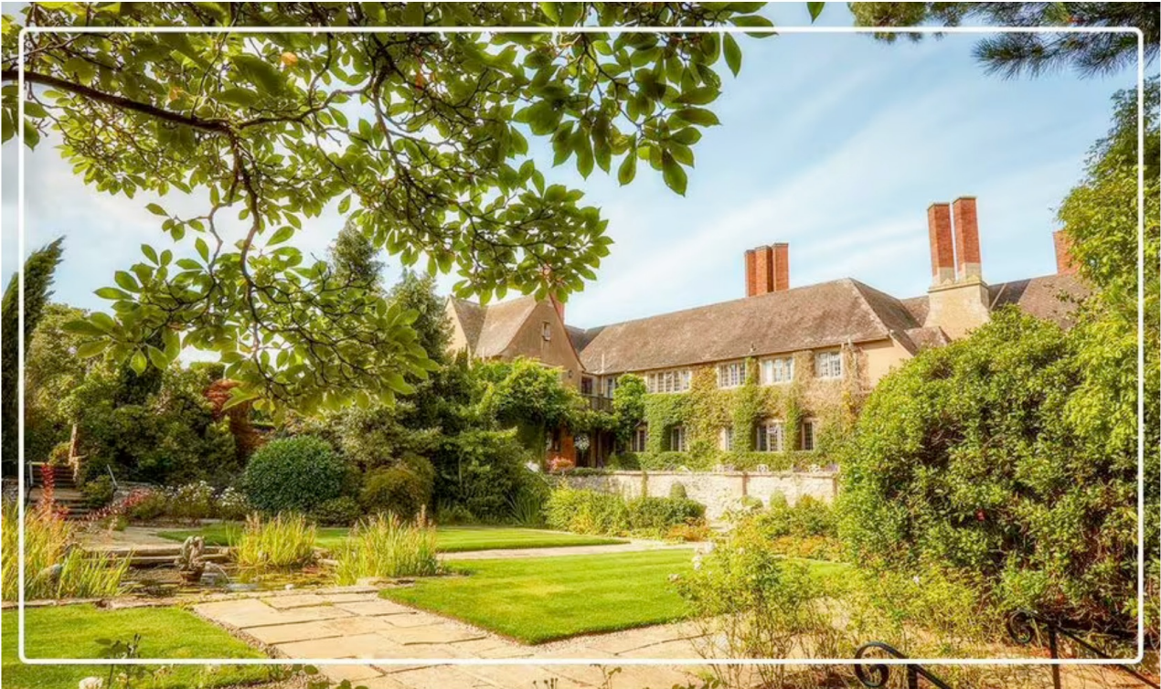
Mallory Court Country House hotel and spa is a beautiful hotel in the Warwickshire countryside

This article contains affiliate links, we will receive a commission on any sales we generate from it. Learn more