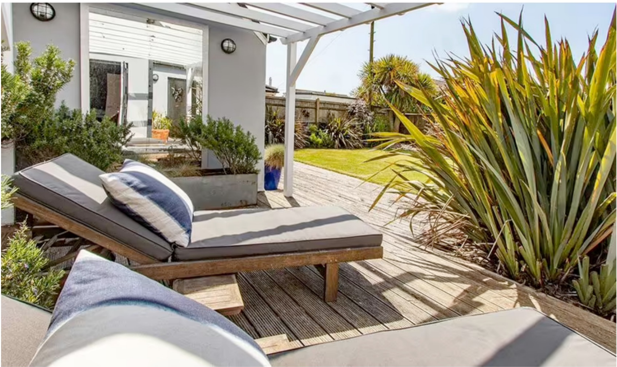
The private sun deck is one of the highlights of Sunnyside

With Camber Sands having recently been dubbed "Britain's best beach for warm temperatures" , this cosy cottage is the perfect home-away-from-home for those hoping for a sunny seaside escape. Sunnyside can sleep up to six adults across three bedrooms and is also dog-friendly.