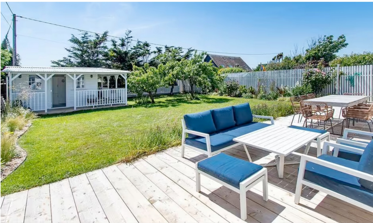
The White House has a beautiful garden perfect for al fresco dining and relaxing

Throw open the double doors, which line the full rear of the house, and allow the fresh air to circulate. Though the house is perfectly suited for summer, there’s also a log burner for chillier days, and a classic roll-top bath begging to be sank into after a wintery walk on the beach.